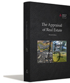
The Appraisal of Real Estate, Fifteenth Edition

The most commonly utilized text books are: